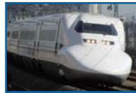
Tokaido & San'yo Shinkansen "HIKARI"

San'yo Shinkansen (622.3 km) Train Names: NOZOMI, MIZUHO, HIKARI (incl. HIKARI Rail Star), SAKURA, KODAMA