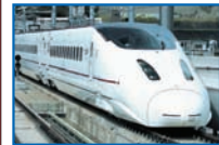
Kyushu Shinkansen "Series 800"

*Hayabusa begins operation on March 5, 2011 *Mizuho and Sakura begin operation on March 12, 2011 *Gran Class (Facilities) will be connected starting March 5, 2011