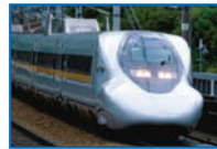
San'yo Shinkansen "HIKARI Rail Star"

Nagano Shinkansen (222.4 km) Train Name: ASAMA