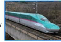
Tohoku Shinkansen "HAYABUSA"

Akita Shinkansen (662.6 km) Train Name: KOMACHI