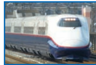
Nagano Shinkansen "ASAMA"

Joetsu Shinkansen (333.9 km) Train Names: TOKI, TANIGAWA Max-TOKI, Max-TANIGAWA