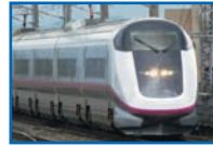
Akita Shinkansen "KOMACHI"

Akita Shinkansen (662.6 km) Train Name: KOMACHI