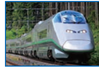
Yamagata Shinkansen "TSUBASA"